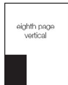
2.125" x 3.5"