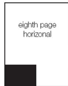
3.5" x 2.125"