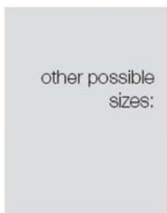
other possible sizes: