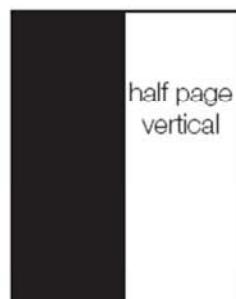
3.5" x 10"