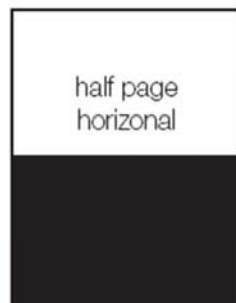
7.5" x 4.75"