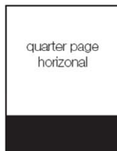
2.125" x 7.5"