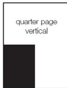
3.5" x 4.75"