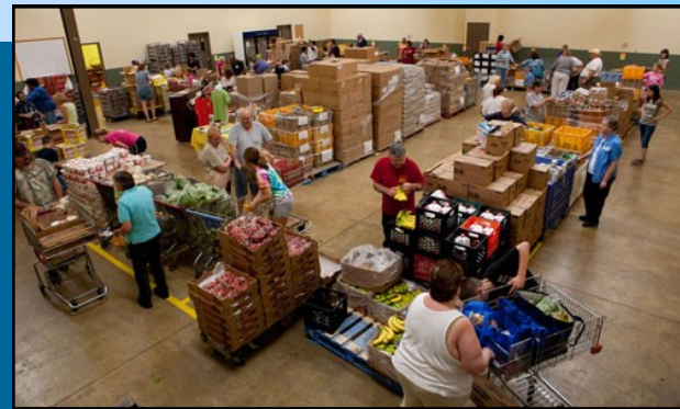
Project Share Food Distribution

Many of the families receiving help have in turn become a volunteer with the organization and donated their time in some way. It is truly inspiring.